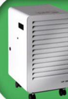
HP 25 Funk