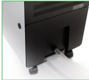
HP 25 FUNK DEHUMIDIFIER