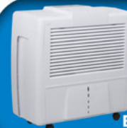
B 280 Funk (alternative B 500 Funk)

COMBINATION OF HUMIDIFIER & DEHUMIDIFIER